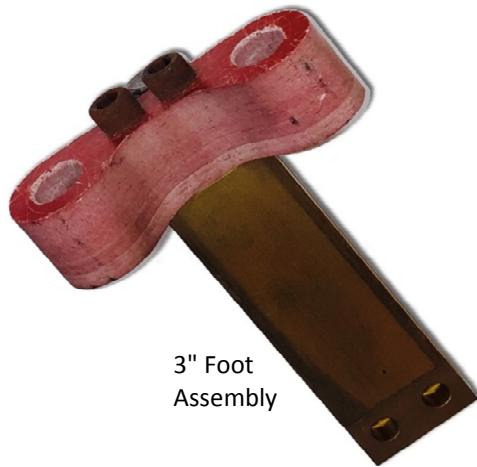
3" Foot Assembly