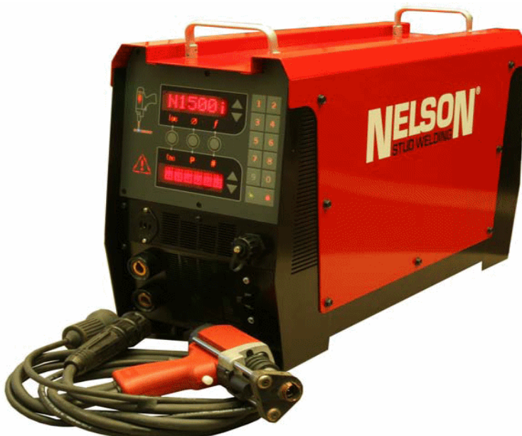
Standard Duty Gun model shown. Wheel kits are available at extra cost.